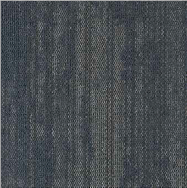
Hard Graft Chill 301