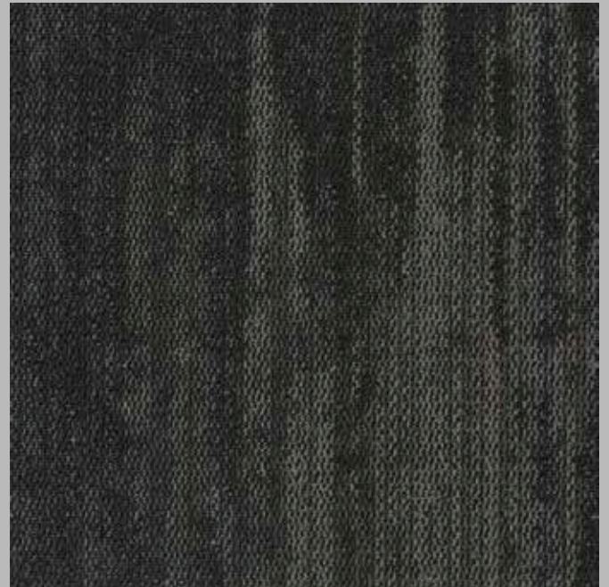
Hard Graft Deep 302