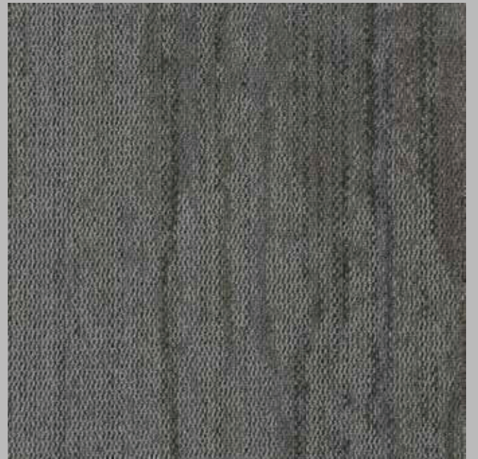
Hard Graft Hype 304